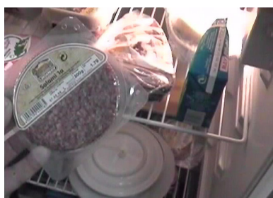
Food in fridge especially pork products is a serious biosecurity risk