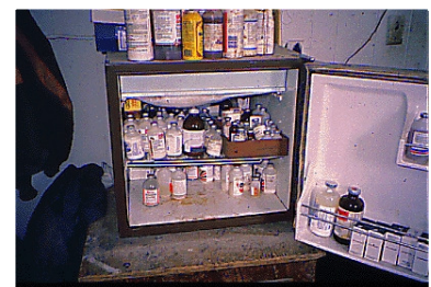
This fridge is overstocked. Air cannot circulate properly and if the fridge fails, a high value of stock will be lost