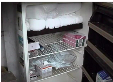
This fridge requires defrosting. The products are at a serious risk of freezing