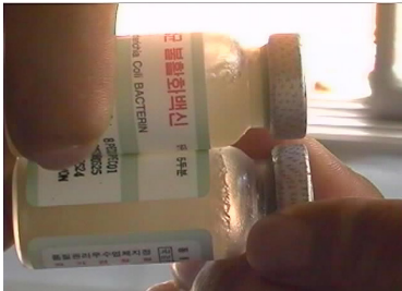
This fridge is running too cold and the lower bottle is frozen. Too hot is just as bad

The following pictures give a flavour of the sorts of problems encountered on many farms with cold medicine storage