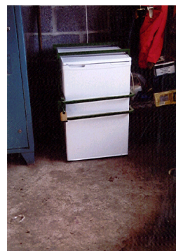
The fridge should be lockable and secure and out of reach of children