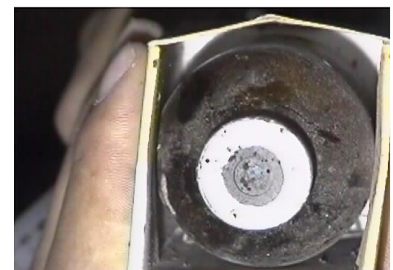
Here bottles and syringes are stored dirty. This can cause infection and abscessation at the injection site