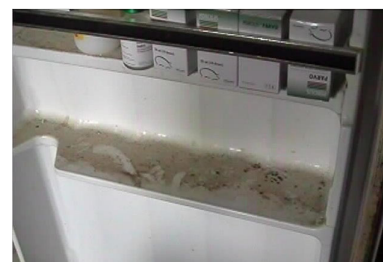
Vaccines in door of fridge. Keep the thermometer near the vaccines