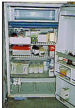
This fridge is dirty and over-full. It is essential that there is adequate air circulation. Note no ice box cover