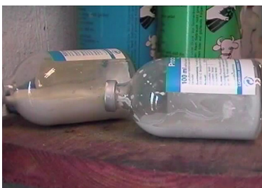
Several bottles of the same medicine open at the same time. Poor medicine management